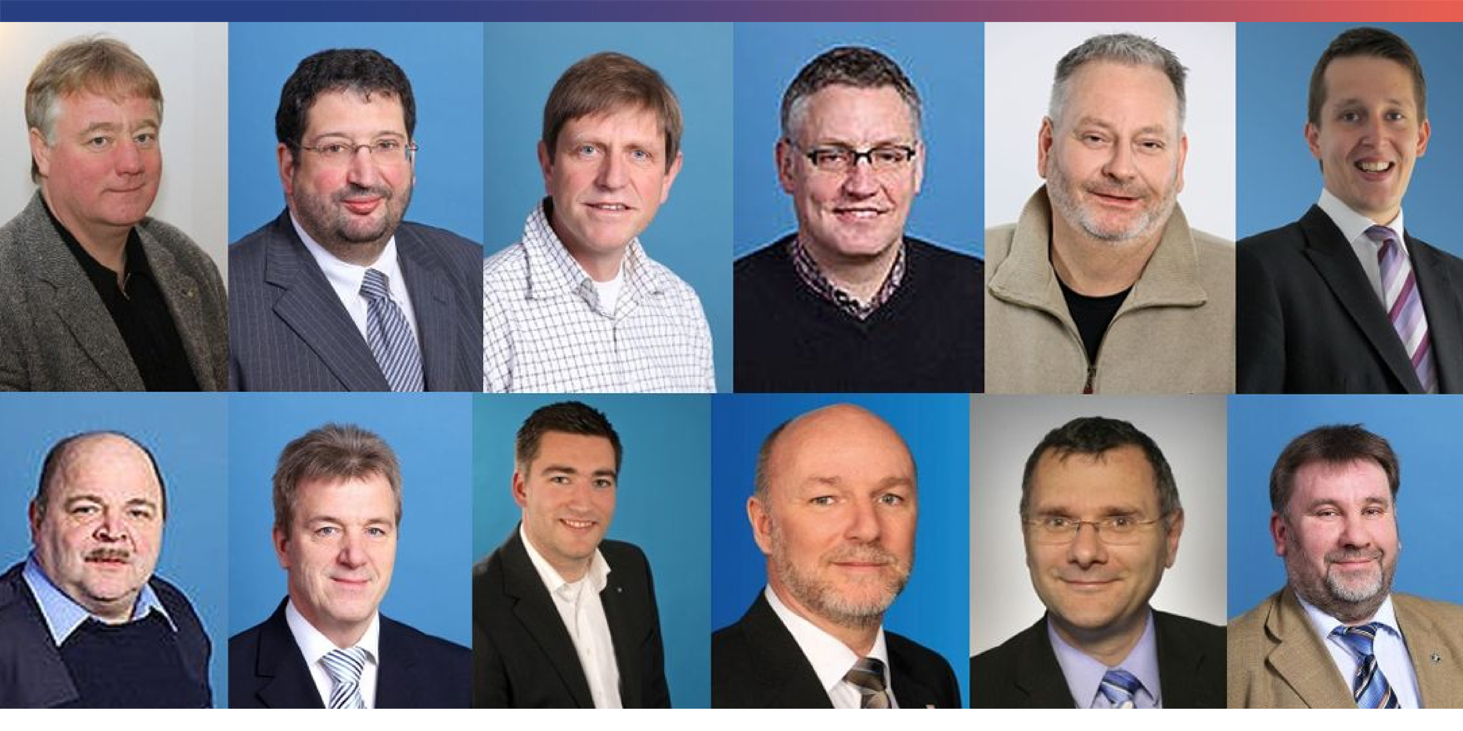
DEMOKRATIE IN BEWEGUNG